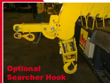
Optional Searcher Hook