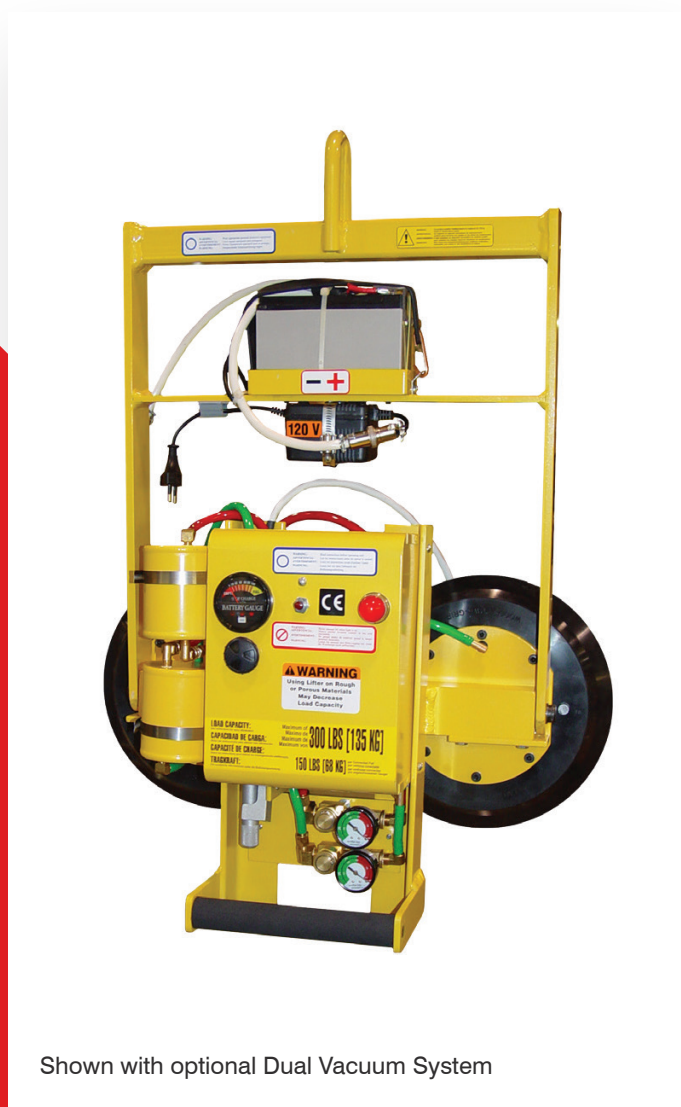
Shown with optional Dual Vacuum System